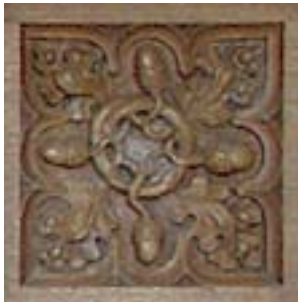
lower ground floor